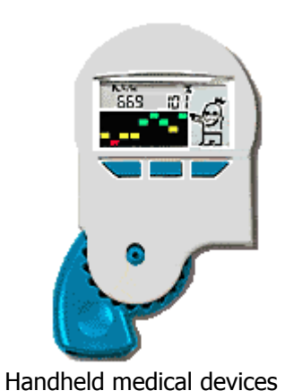
PDA software and accessories